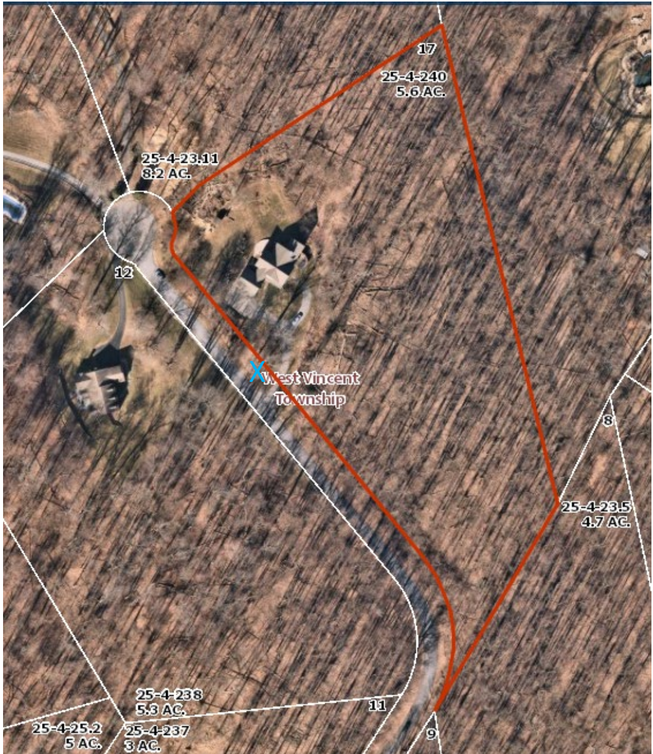
Zoning Hearing Board Posting Map - 16 Hunt Hill Road, West Vincent Township